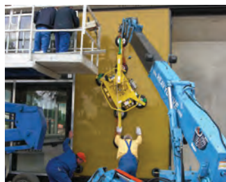
New Edeka building in Dillingen