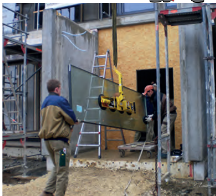
Glazing in a courtyard

View all suction systems from p.330 for a better comparison.